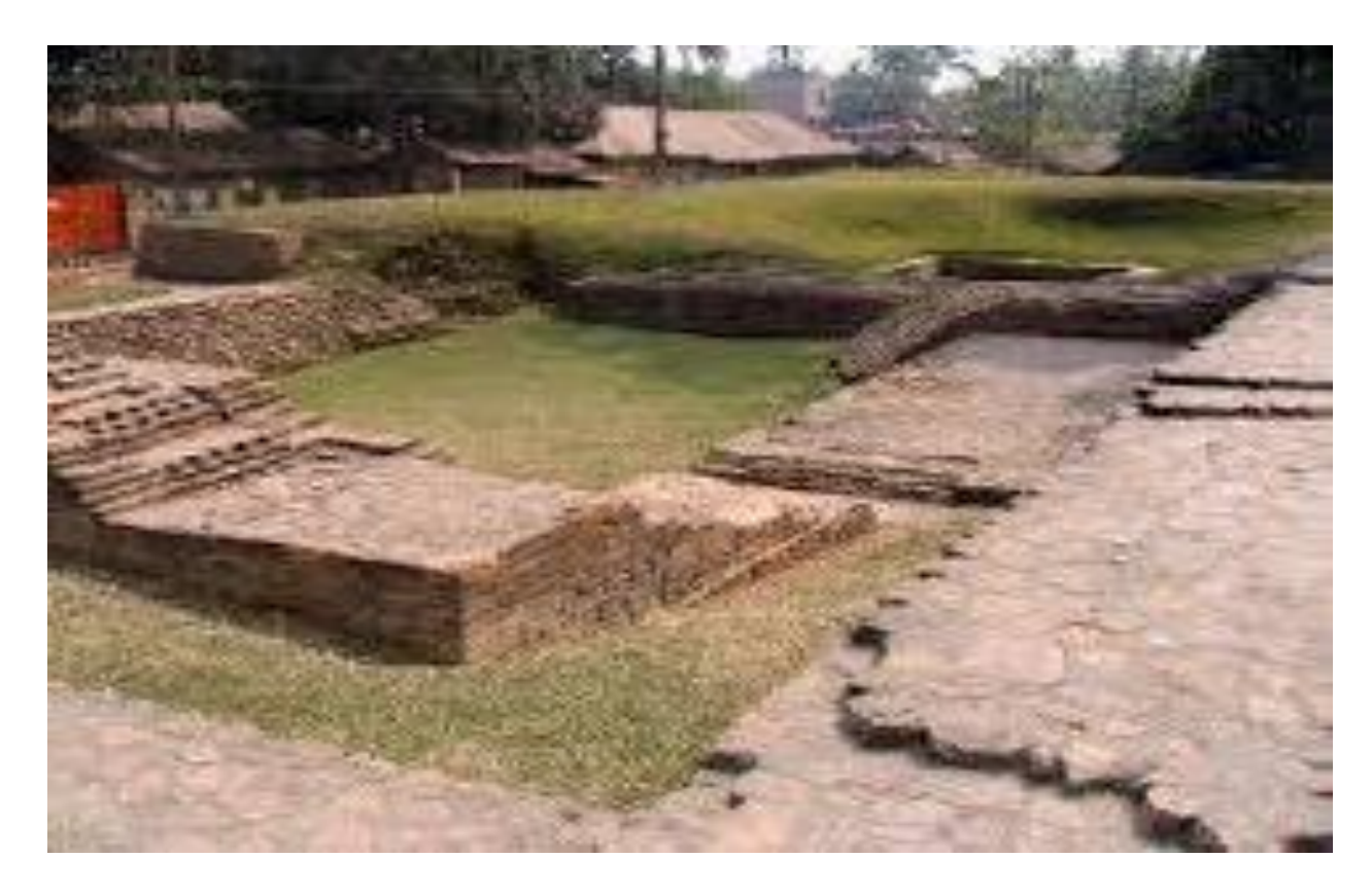
CHANDRAKETUGARH: THE ANCIENT PORT CITY

West Bengal can boast of many ancient historical locations of which one of utmost importance is the archaeological site of Chandraketugarh situated in Berachampa of North 24 Parganas. Sites of Haroa, Debalaya, Hadipur, Singherati, etc. have yielded similar relics of ancient Bengal.